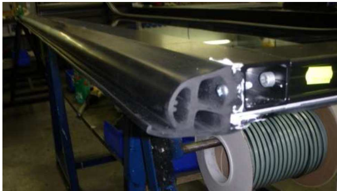
Figure 5: Screw head against the side seal