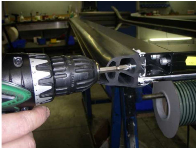
Figure 4: Screw through the side seal from an angle into the drilled hole in the frame.