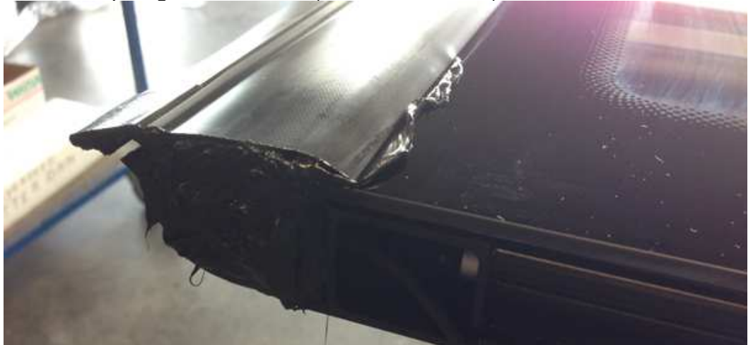
Figure 9: Seal the top edge