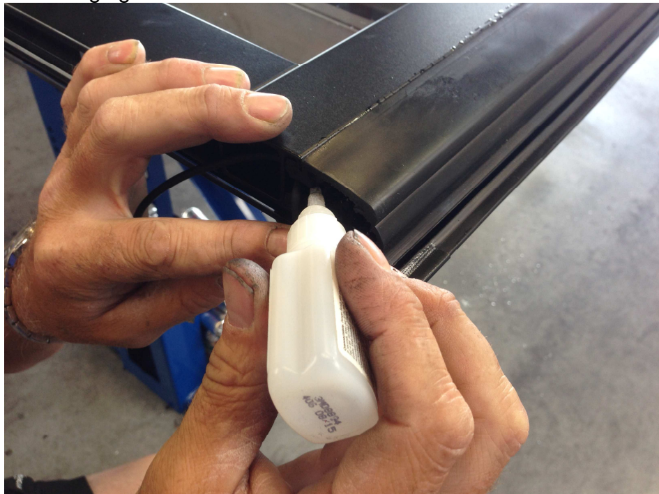
Figure 7: Gluing the cable to the side seal