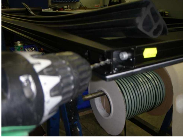
Figure 3: Drill a hole of \text{Ø}4.2\text{mm} in the frame