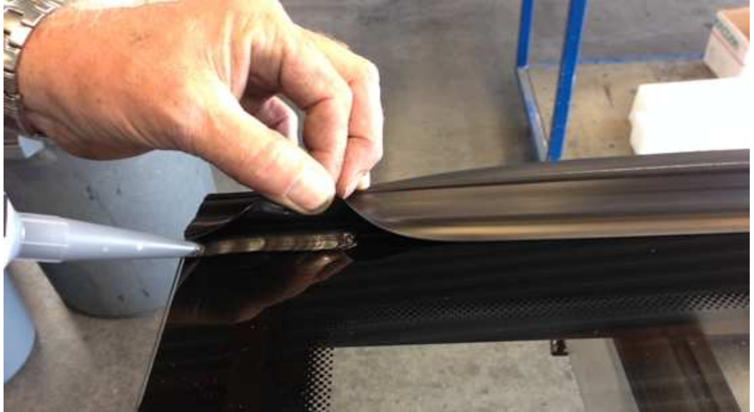
Figure 8: Gluing of the edges