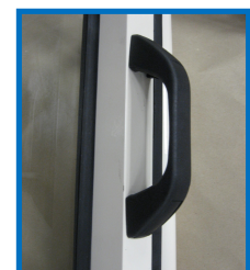
BLACK Internal Pull handle