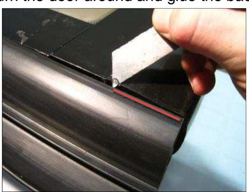
Glue back side

7.5. Turn the door around and glue the backside.