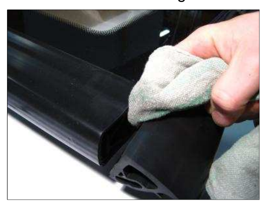
Primer the rubber with Loctite primer 770

7.4. Use the tip of the knife to place the Loctite glue 406 on the rubber. First glue the corner of the rubber (red part). Then push the 2 sides together and wait a view seconds till the rubbers are glued. Now glue the blue part the same way.