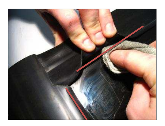
Cleaning before sealing

7.7. Place on both sides 10cm Simson STR 360 between the rubber and the glass to ensure that the rubber will not move.