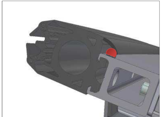
Placing Simson STR 360

7.8. Push the edge of the rubber on the glass so the excess sealant comes out.