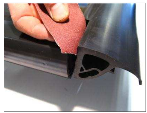
Cleaning rubber with sandpaper